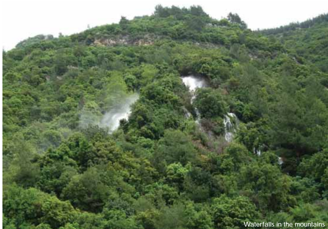
Waterfalls in the mountains