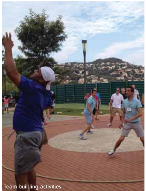
Team building activities