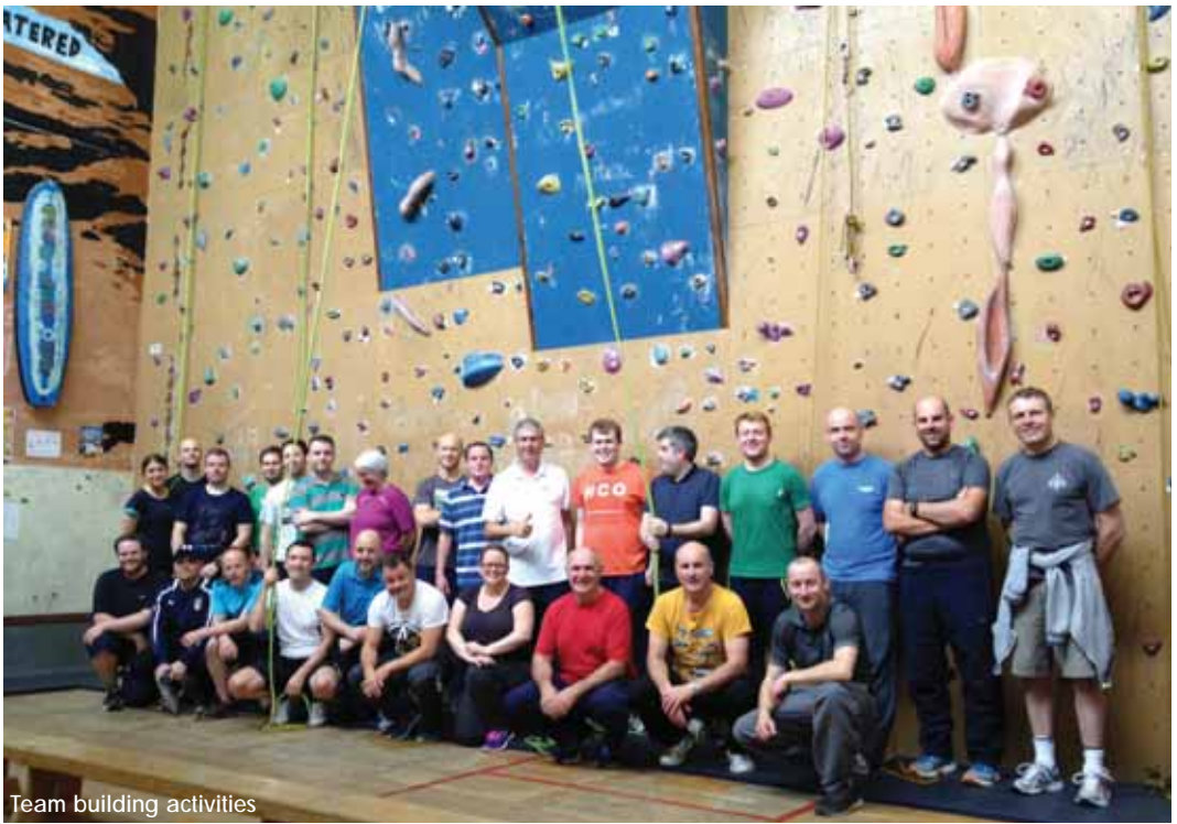
Team building activities