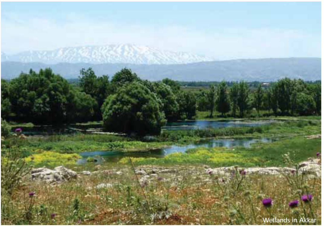
Wetlands in Akkar