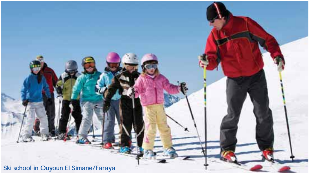
Ski school in Ouyoun El Simane/Faraya