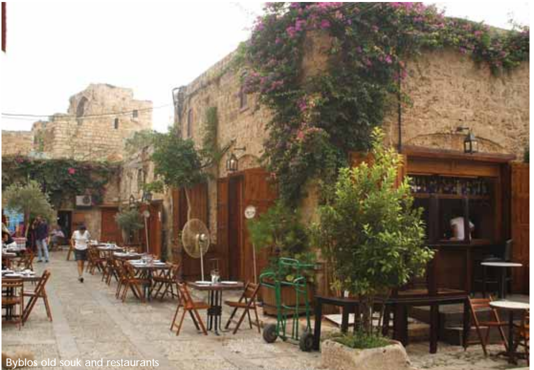
Byblos old souk and restaurants