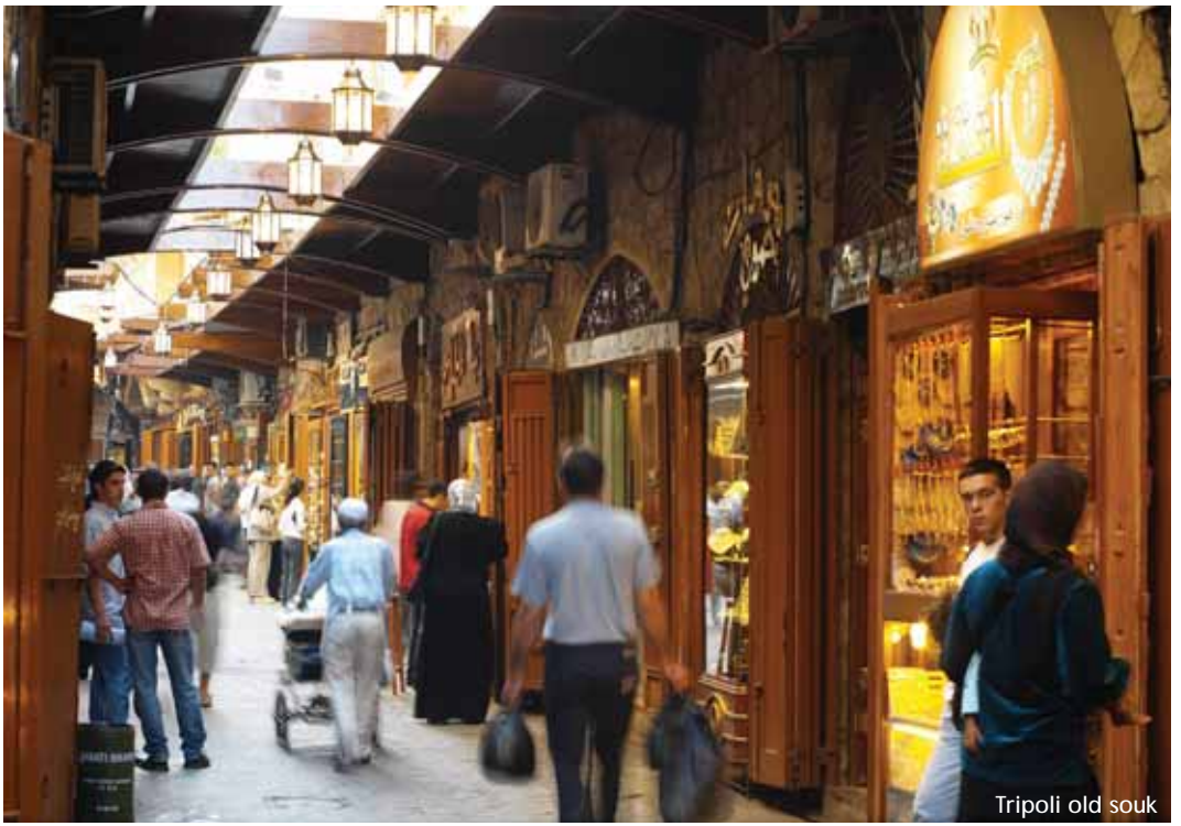
Tripoli old souk