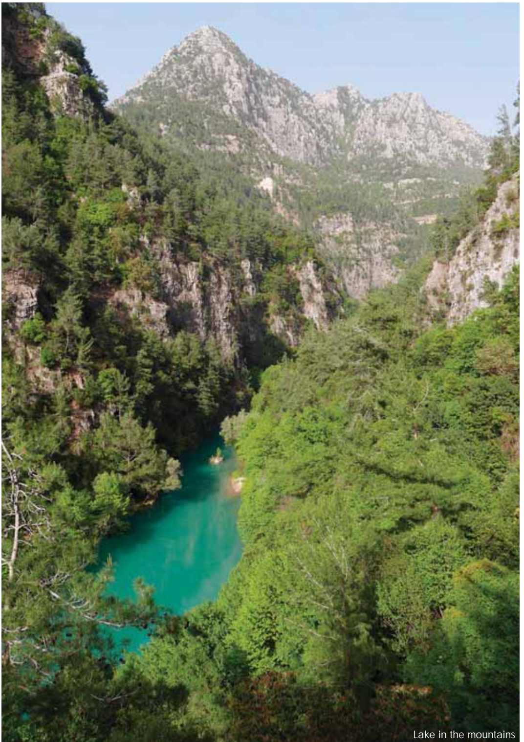
Lake in the mountains