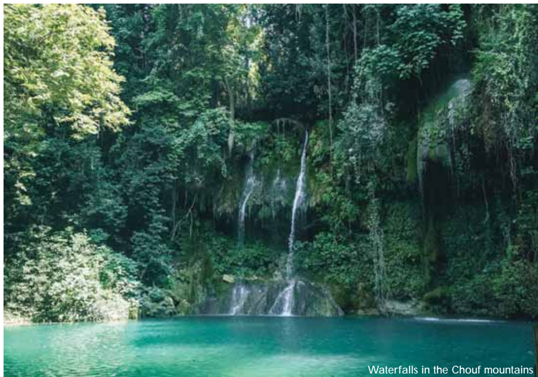
Waterfalls in the Chouf mountains