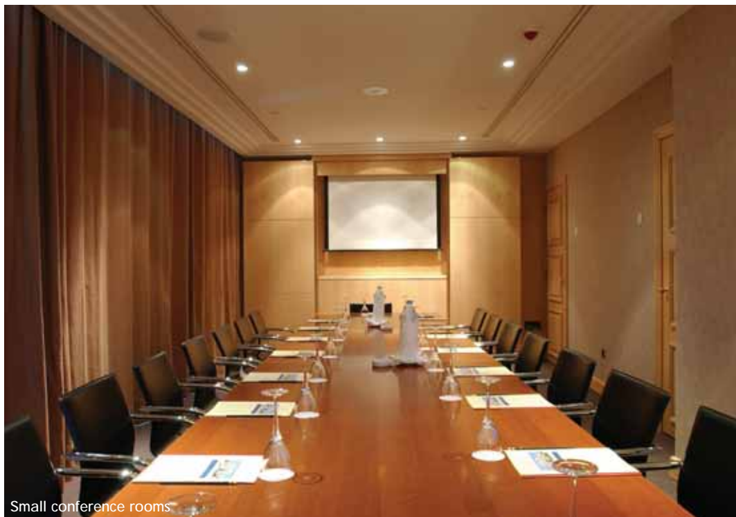
Small conference rooms