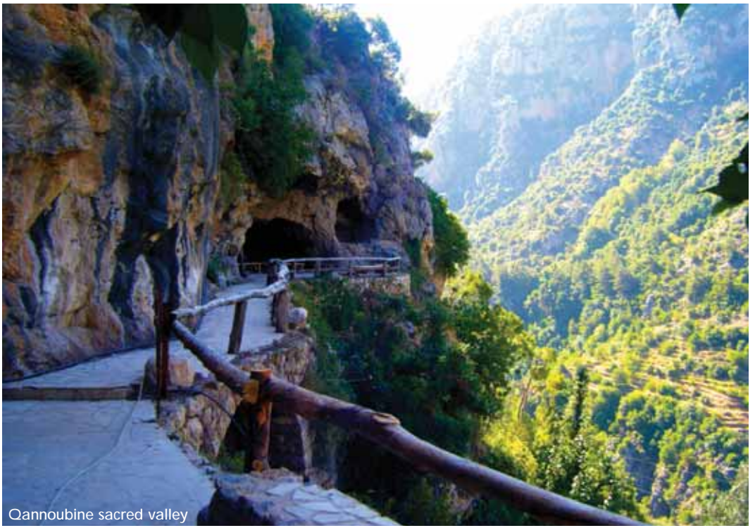
Qannoubine sacred valley