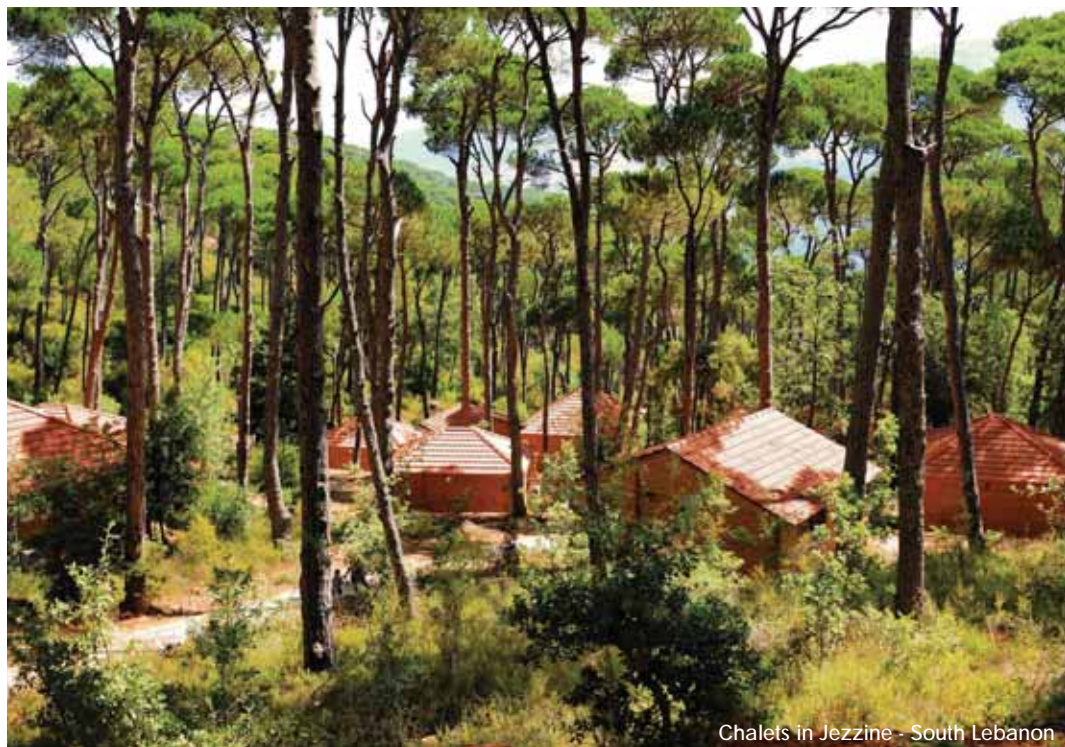
Chalets in Jezzine - South Lebanon