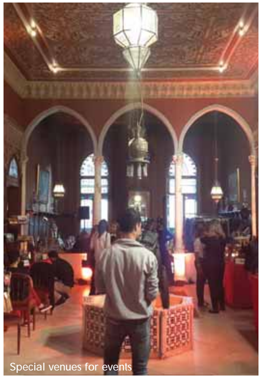
Special venues for events