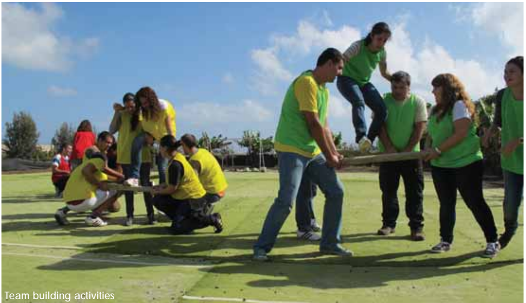
Team building activities

With multiple venues, Hotels, sports clubs, facilities and a large variety of employee training professionals, Lebanon can offer a very good venue for any company trying to improve productivity and team cohesion among its employees.