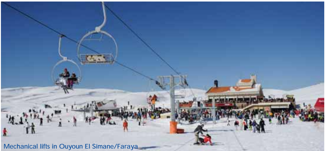
Mechanical lifts in Ouyoun El Simane/Faraya