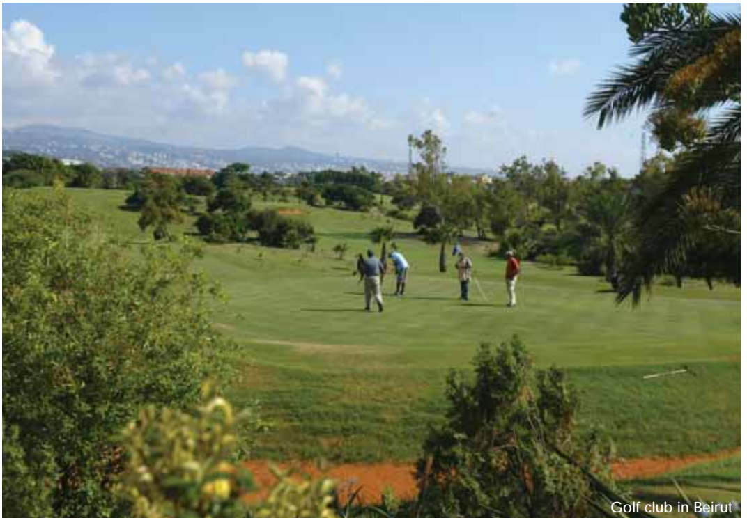
Golf club in Beirut