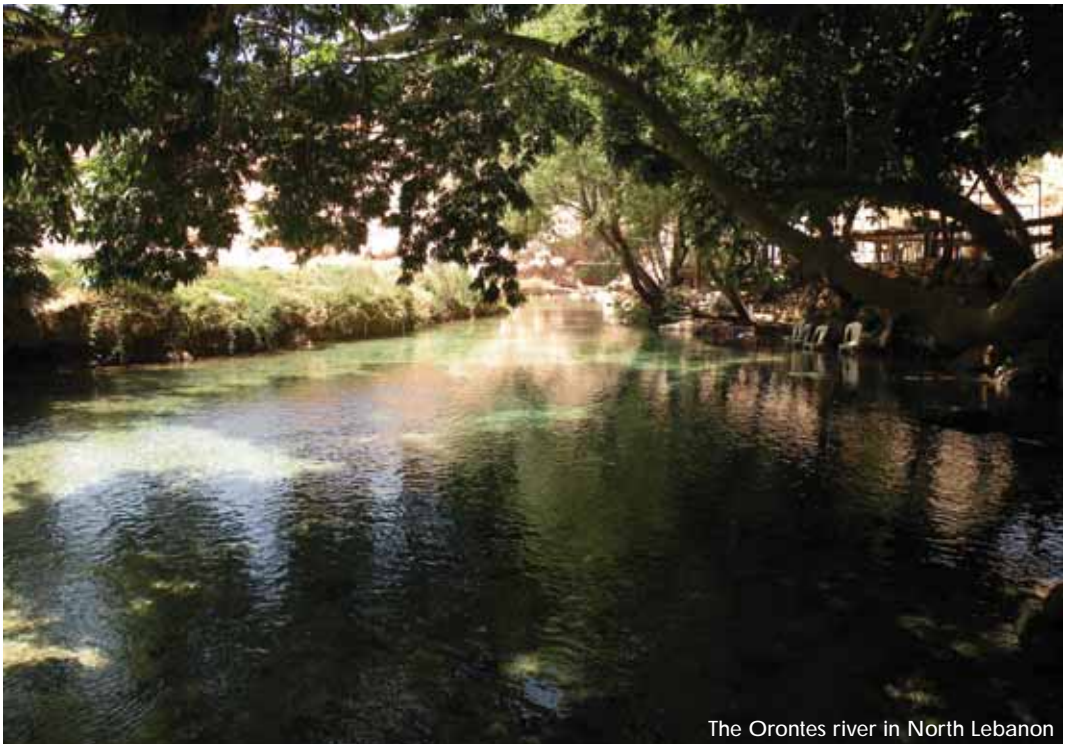
The Orontes river in North Lebanon