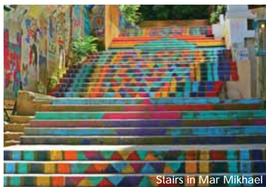
Stairs in Mar Mikhael