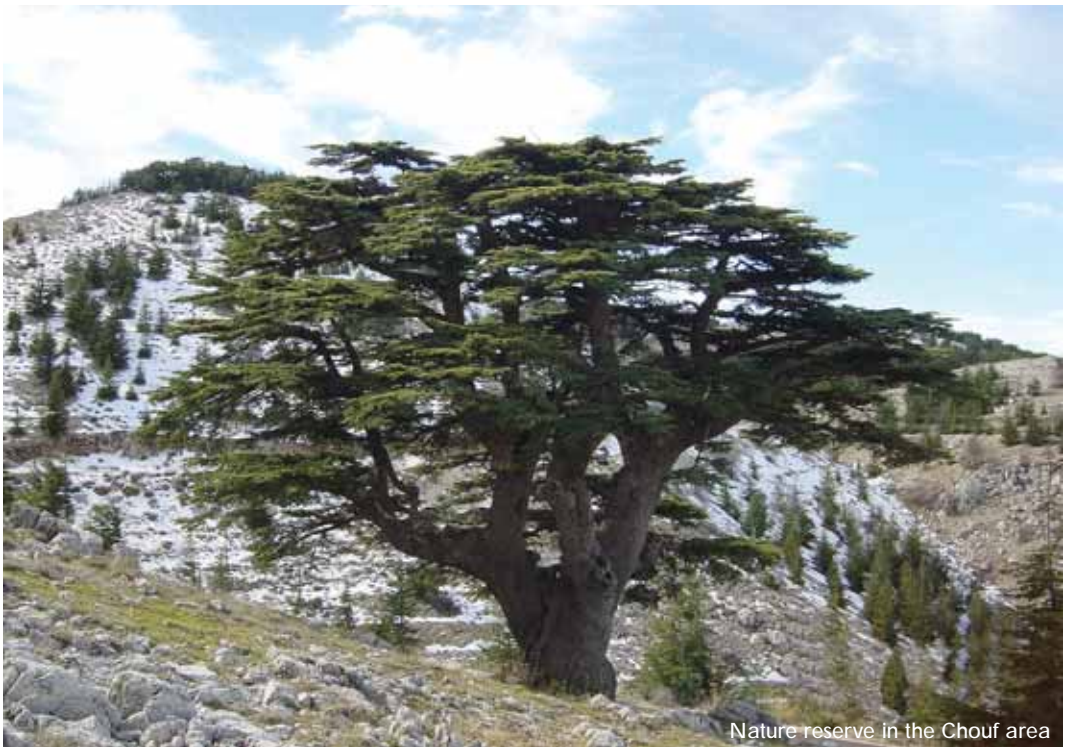
Nature reserve in the Chouf area