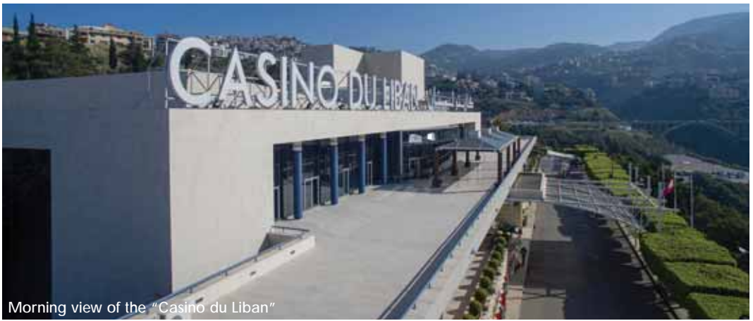
Morning view of the "Casino du Liban"