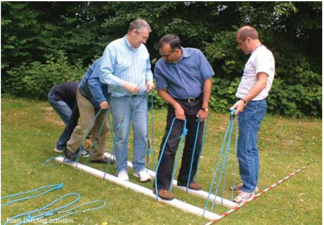
Team building activities