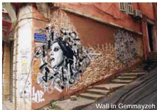
Wall in Gemmayzeh