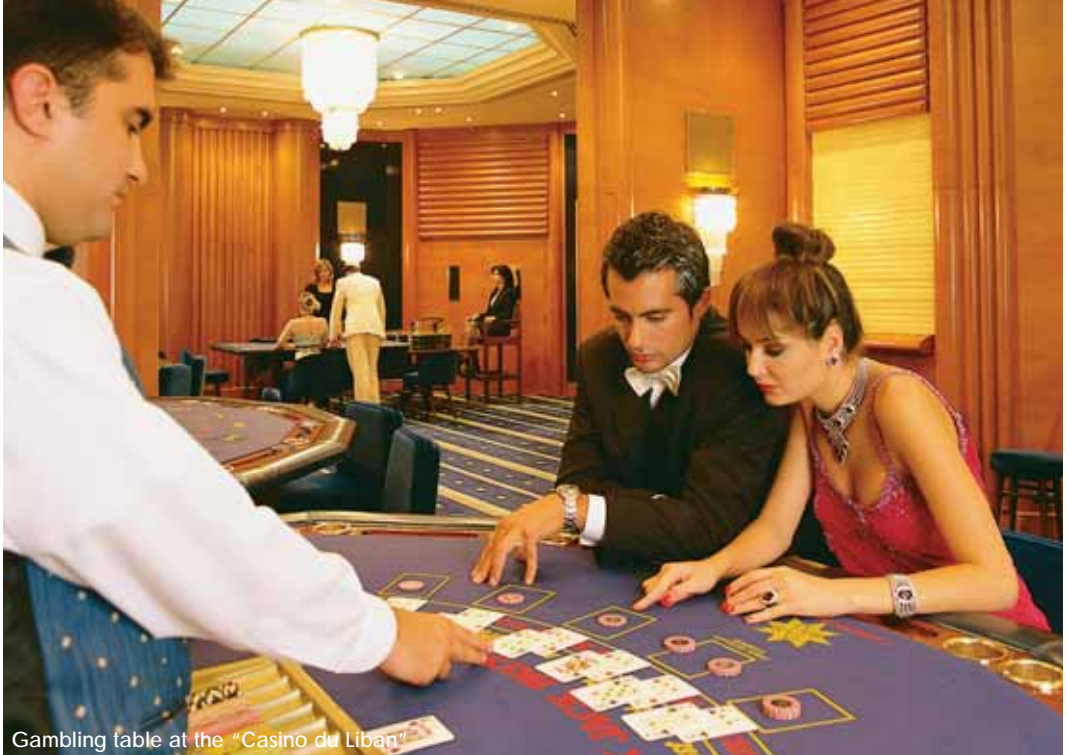
Gambling table at the "Casino du Liban"

It also has a showroom with international shows, night club, theater, banquet facility and restaurants.