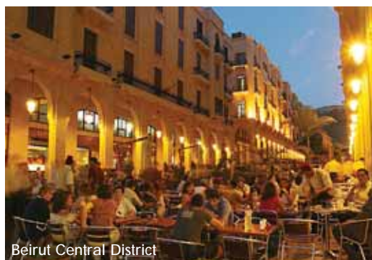
Beirut Central District