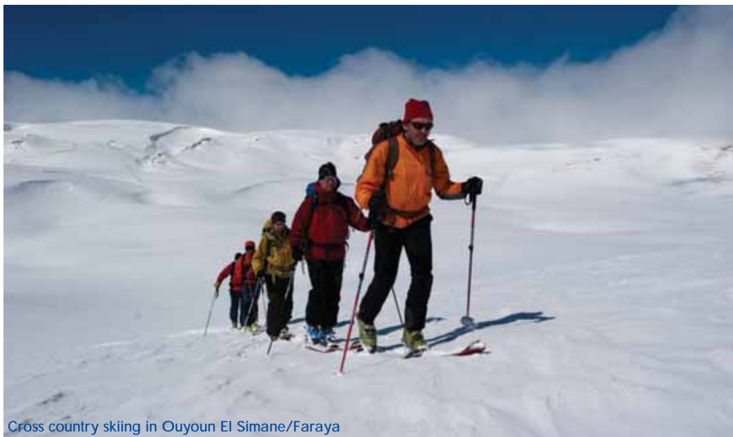
Cross country skiing in Ouyoun El Simane/Faraya

Ouyoun El Simane (Faraya), Cedars, Laklouk, Faqra, Zaarour Monitors for all levels and ages at all ski resorts