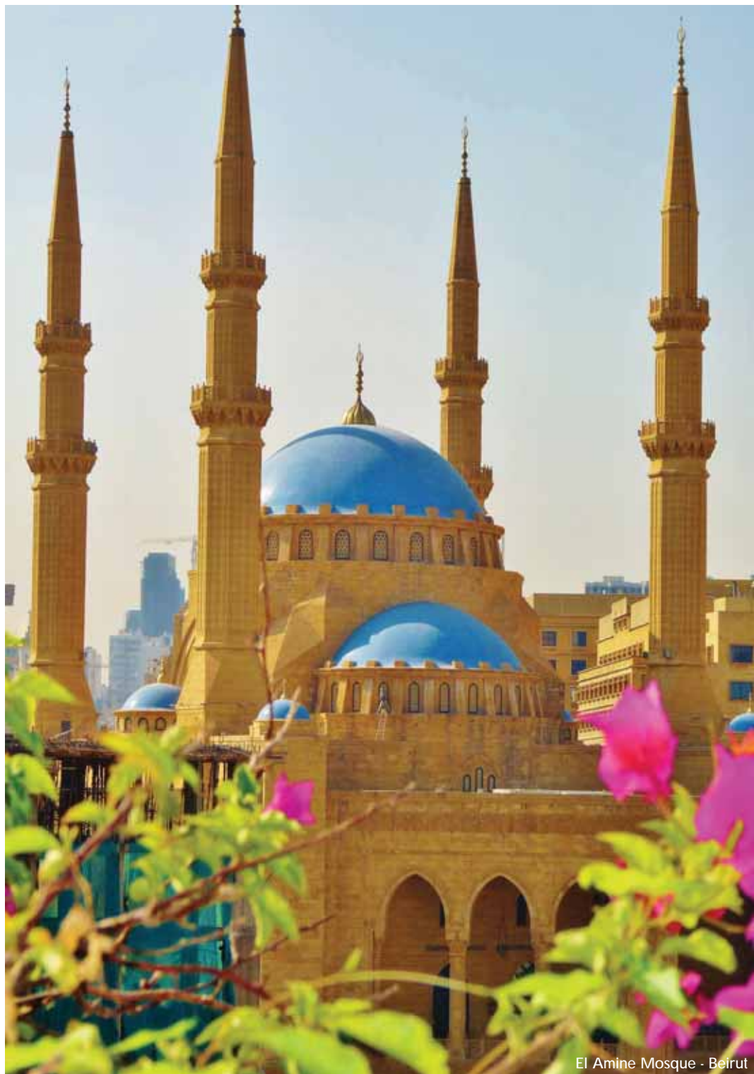
El Amine Mosque - Beirut