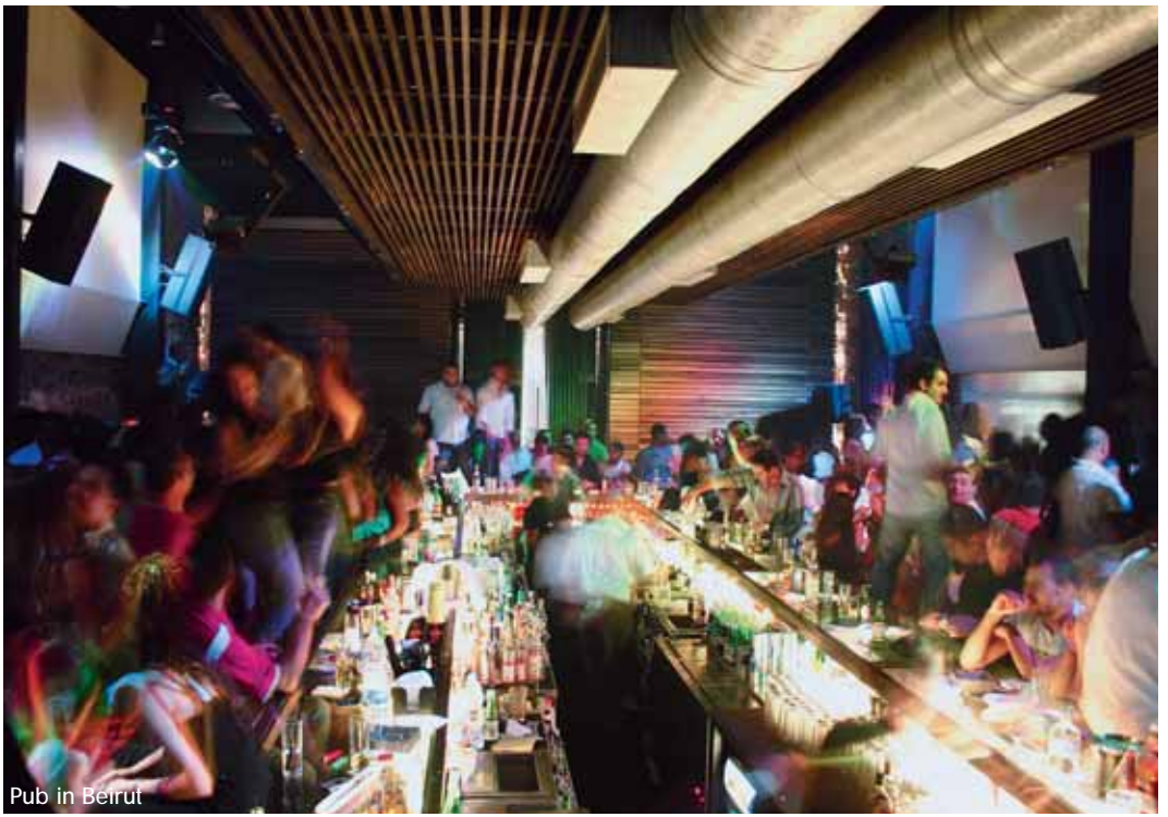
Pub in Beirut