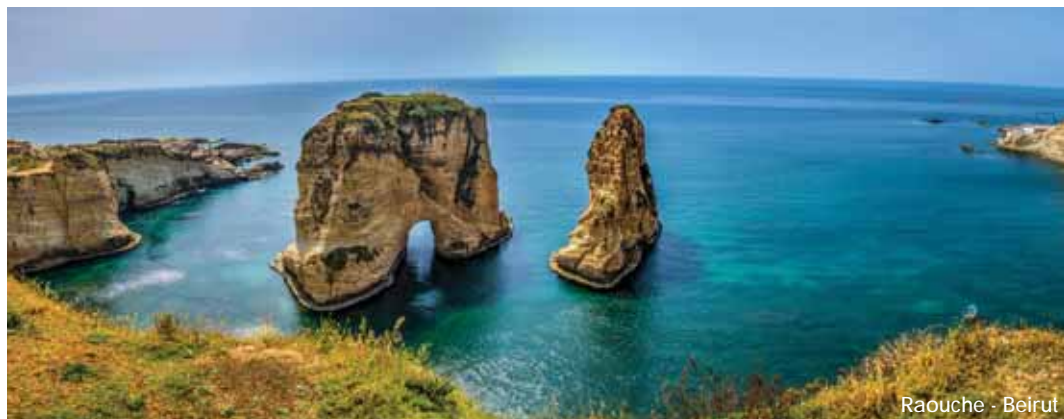
Raouche - Beirut