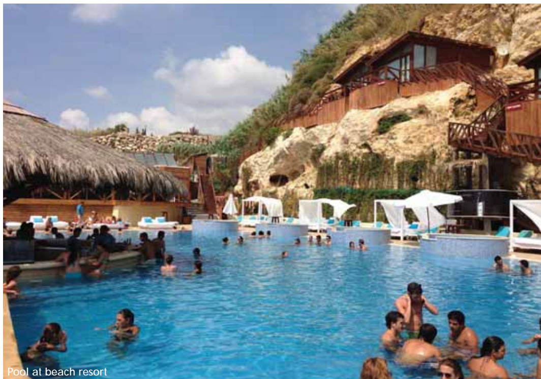
Pool at beach resort