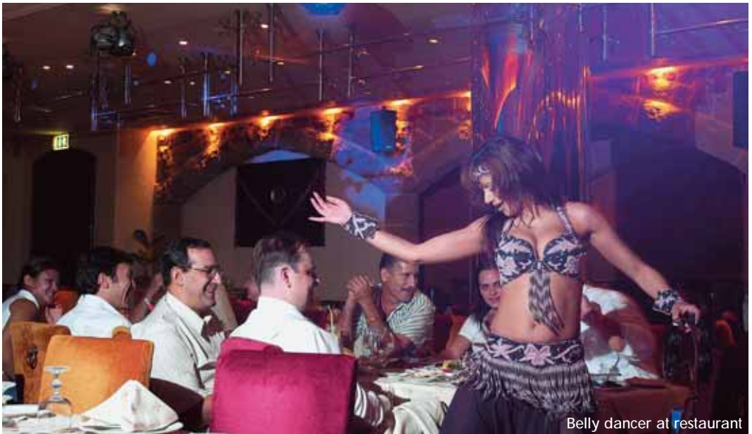
Belly dancer at restaurant

4 and 5 stars hotels equipped with the most modern audiovisual equipment and communication facilities for teleconferencing. Small, medium and large meeting rooms. Social activities. First class restaurants. Night clubs. Excursions. Connections to all destinations.