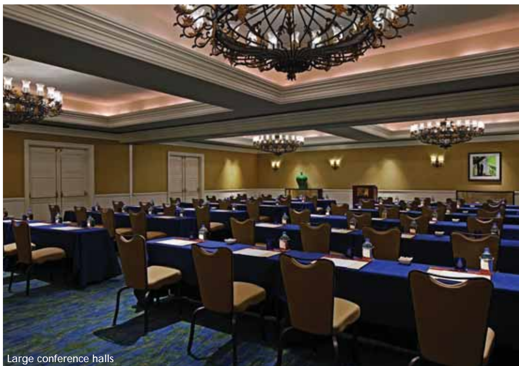
Large conference halls