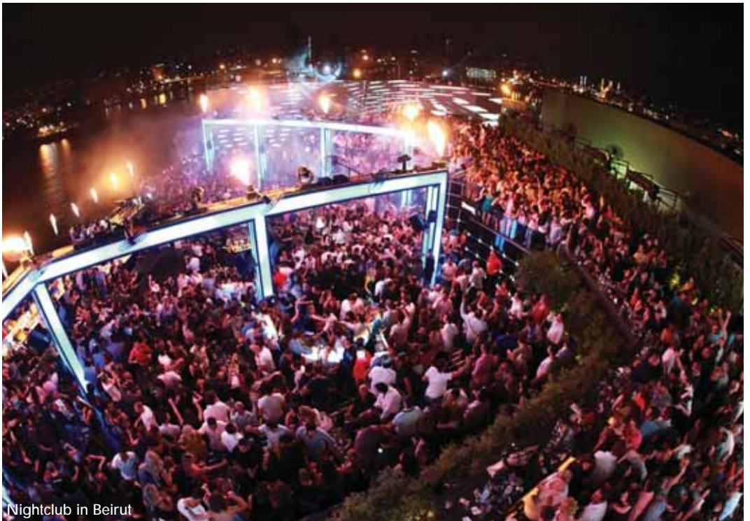
Nightclub in Beirut