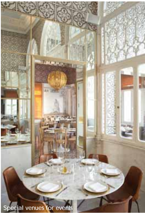
Special venues for events