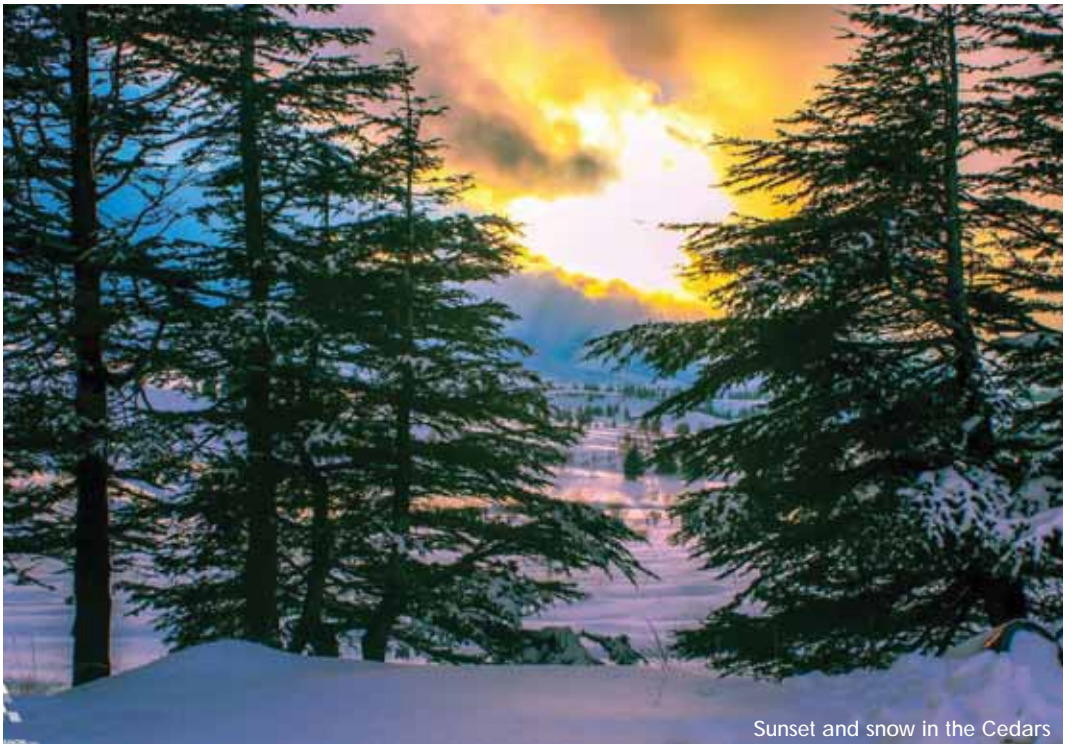
Sunset and snow in the Cedars