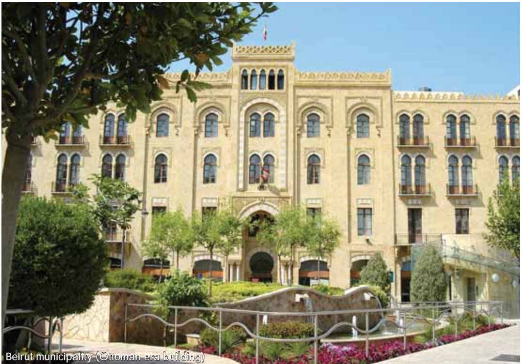
Beirut municipality (Ottoman era building)