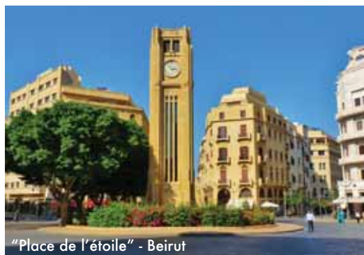
"Place de l'étoile" - Beirut