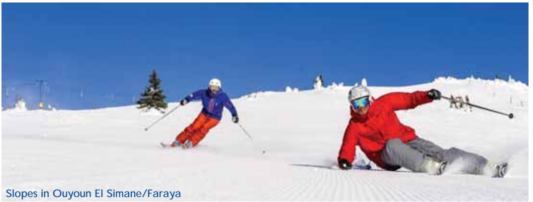
Slopes in Ouyoun El Simane/Faraya