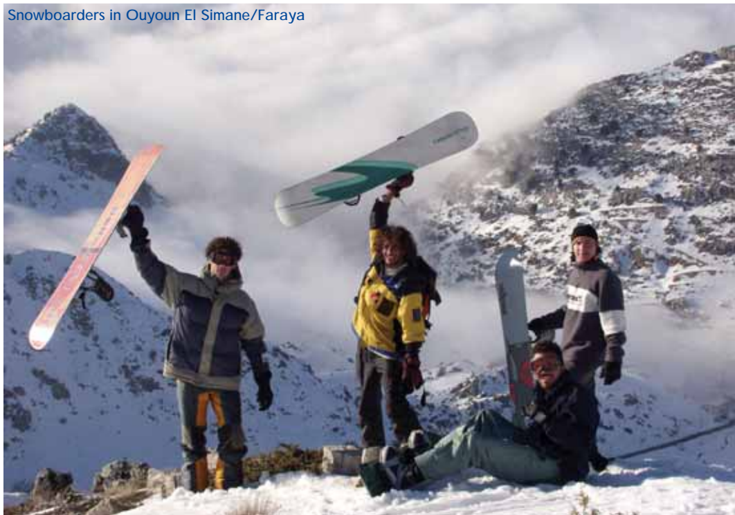
Snowboarders in Ouyoun El Simane/Faraya